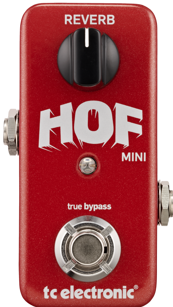
Hall of Fame Mini Reverb